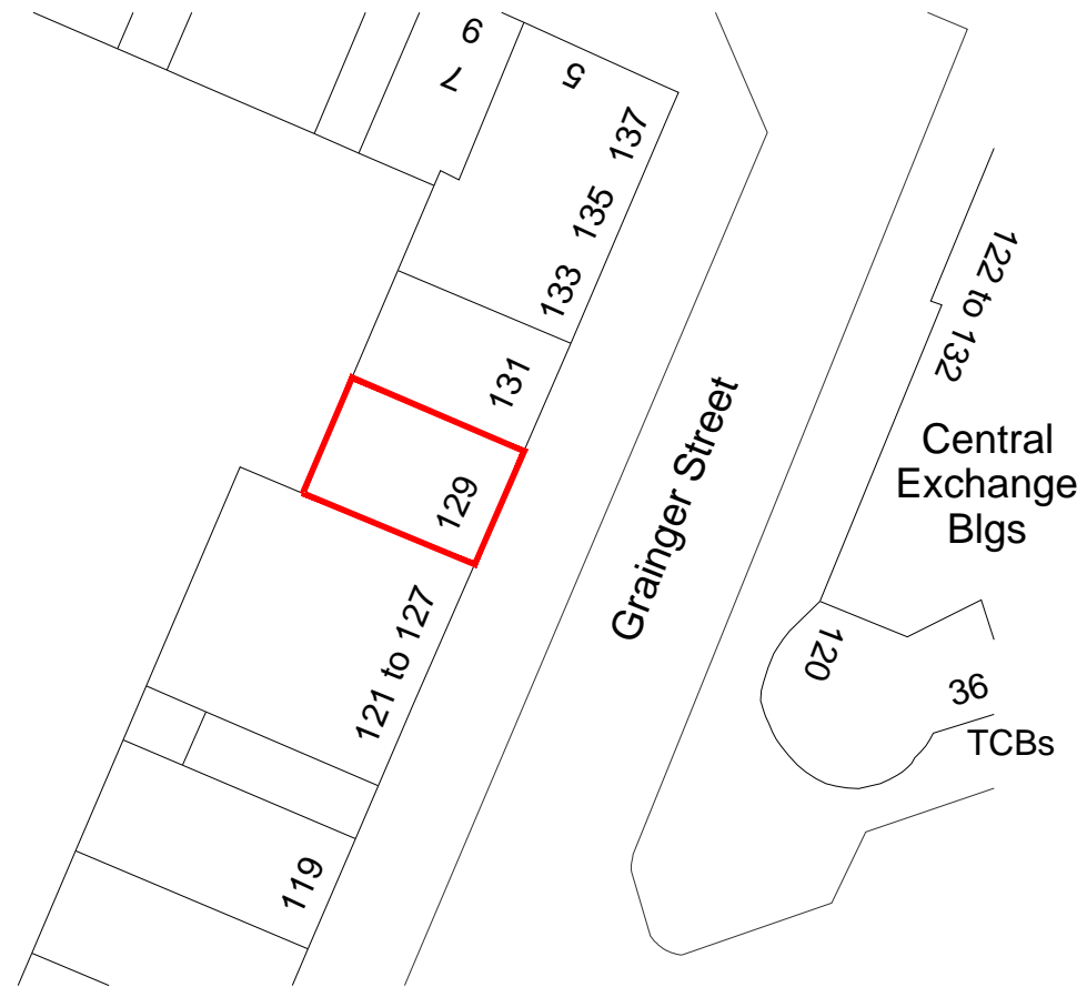
Site Plan Scale: 1:500 @ A3